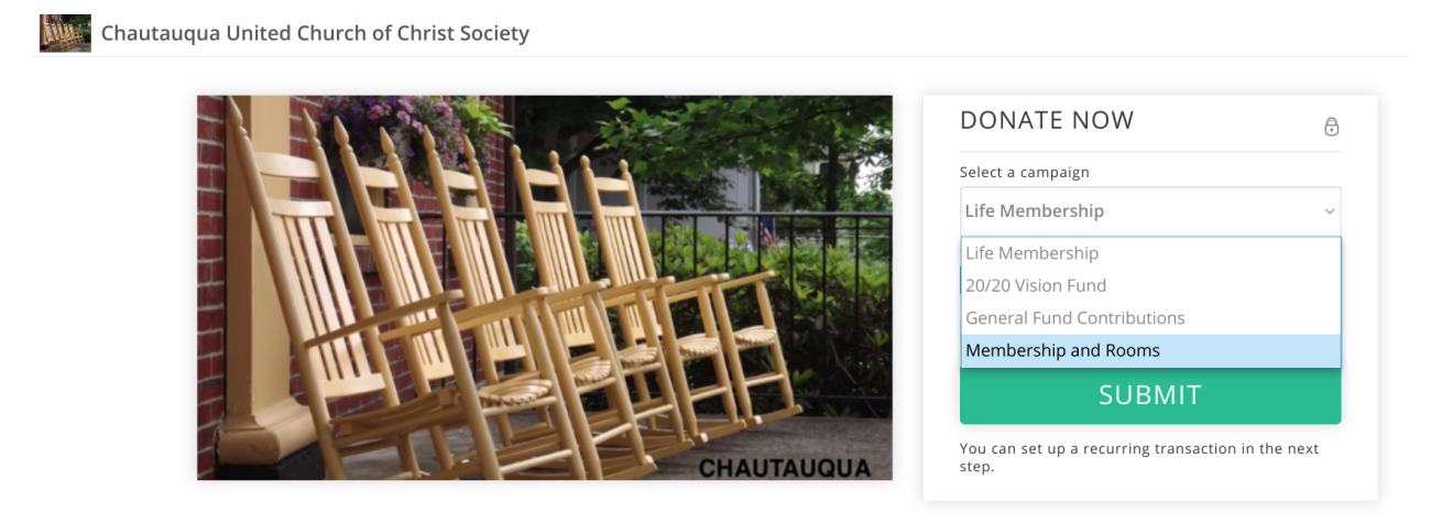
About Chautauqua United Church of Christ Society

After you submit the Request for Membership and Room Reservation form, you will be taken to a donation page. On this page, select the Membership and Rooms campaign from the drop down box as shown below: